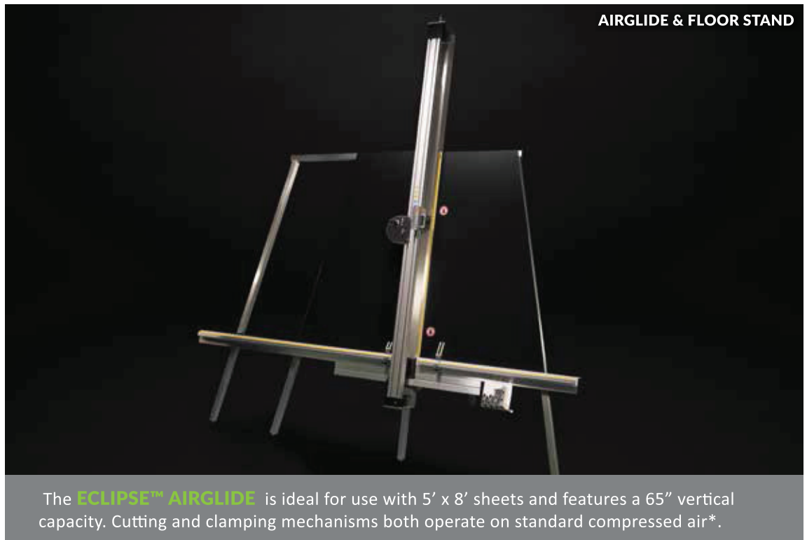
AIRGLIDE & FLOOR STAND

The ECLIPSE™ AIRGLIDE is ideal for use with 5' x 8' sheets and features a 65" vertical capacity. Cutting and clamping mechanisms both operate on standard compressed air*.